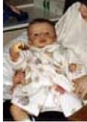
Me – 8 months old and waiting for my 2 nd and 3 rd operation